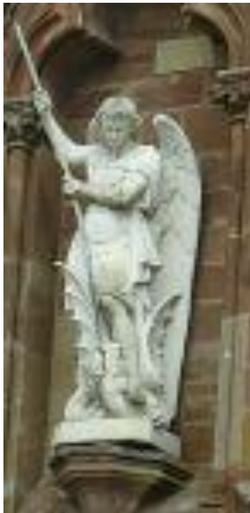
The Angel, Michael

More likely however, rather than a literal place, this is 'a time of relative peace' for Israel during the first half of the seven year Great Tribulation period, which begins at the breaking of the 6 th Tribulation Seal and will last until the Sounding of the 6 th Tribulation Trumpet.. This is the time that they make the peace treaty as referred to in Daniel 9 verse 27 . (End Commentary Break).